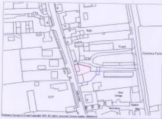
OS SITE LOCATION PLAN (Scale 1:1250)